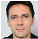
Professor of Economics PhD in Economics University of Lille I